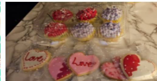
VALENTINE'S DAY TREATS!