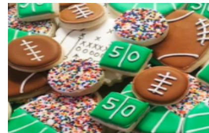
SUPER BOWL COOKIES!

I've always loved to bake, but I never realized how much until I started baking for others. I've only been doing this for a few months now, and I've learned so much, I've received so much support from the online community, and I hope to get more from my local neighbors. Cookies are my specialty, but I also love making cupcakes, mini loafs & pumpkin bread!