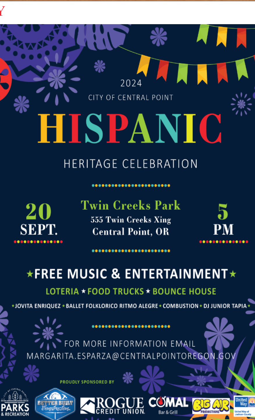
Location: Twin Creeks Park, 555 Twin Creeks Crossing, Central Point