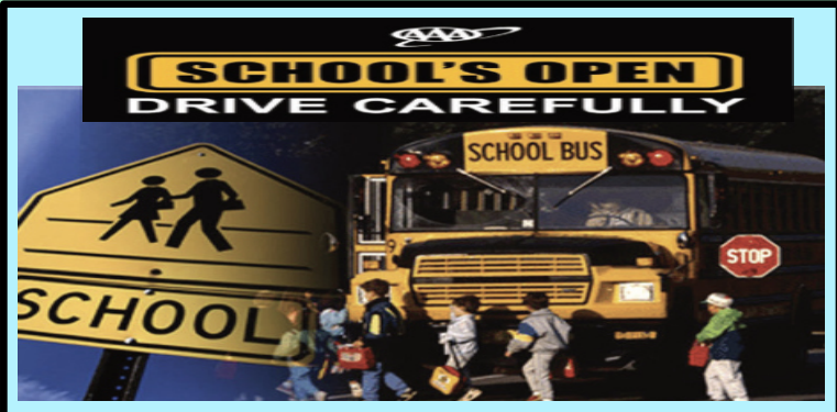
Sharing the Road with School Buses

If you're driving behind a bus, allow a greater following distance than if you were driving behind a car. It will give you more time to stop once the yellow lights start flashing. It is illegal in all 50 states to pass a school bus that is stopped to load or unload children.